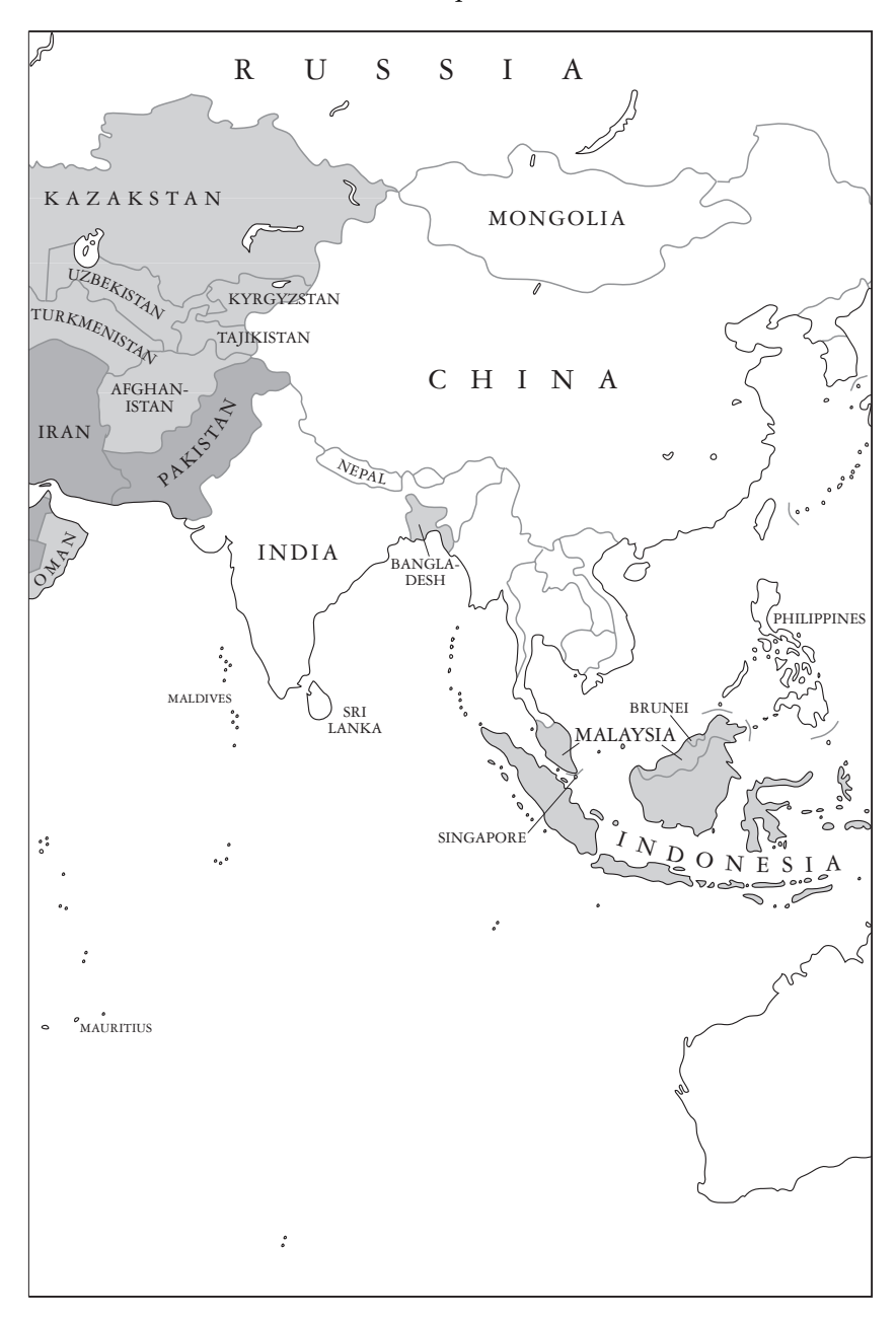
Map 2. (cont.)