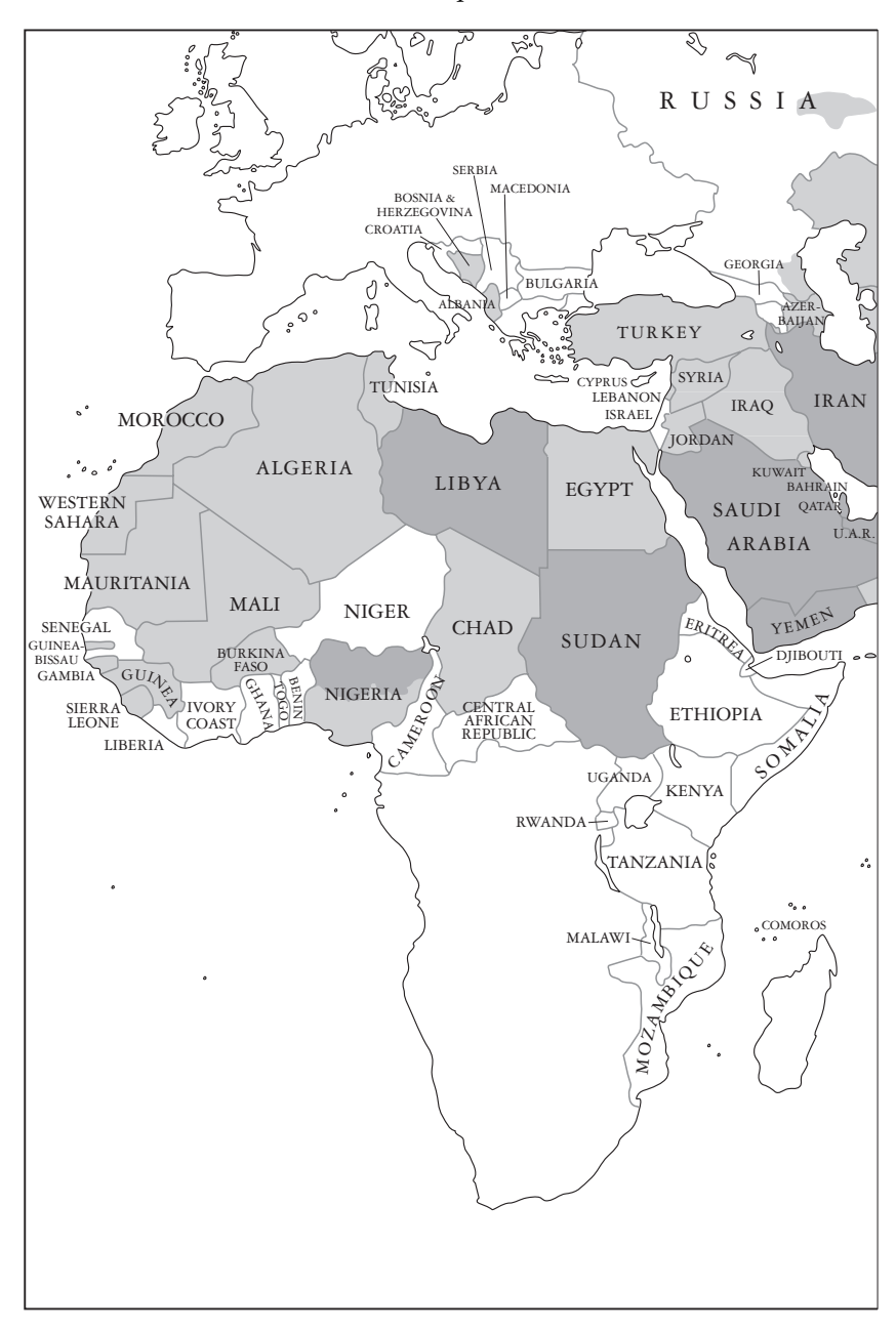
Map 2. Countries implementing Shari'a criminal law (dark grey)